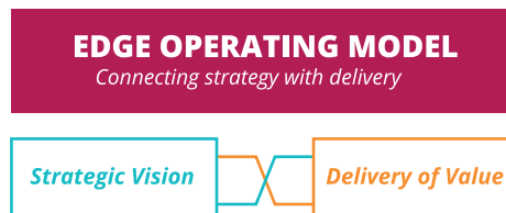
Figure 1-1 EDGE: an operating model.

According to a McKinsey study, “IT organizations are asked to innovate at breakneck speed in support of their companies’ ambitious digital aspirations (85 percent of respondents want their operating models to be mostly or fully digital, which only 18 percent currently have).” 4 So the vast percentage of organizations have digital aspirations, yet only 18 percent consider themselves successful. Why the disparity? Because there is a big difference between the ambition and knowing how to achieve it. EDGE focuses